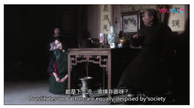
Figure 9. Douzi's mother kneeling down