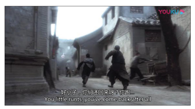
Figure 7. Fleeing from the punishment

subtitles go "You little runts, you've come back after all" with the analyzed results in Table 7..