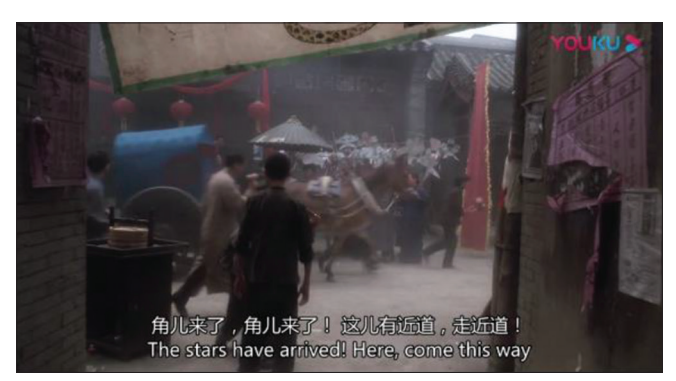
Figure 6. Encountering the opera star