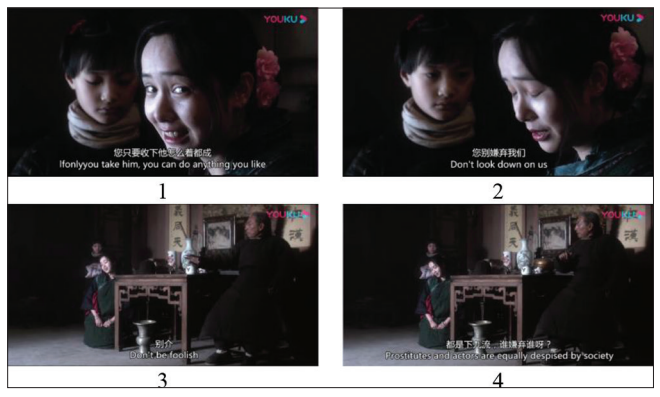
Figure 3. Douzi's mother imploring the headman

The subtitling strategies have been analyzed from the perspective of multimodality. The methods involve deduction with condensation, reductive paraphrasing and dele-