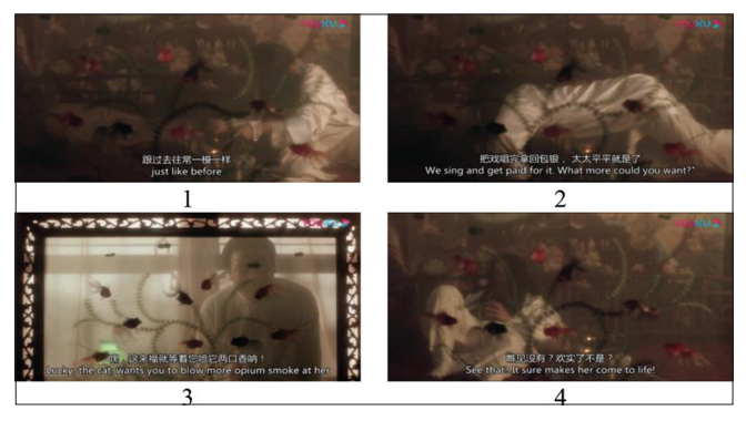
Figure 4. Dieyi taking opium