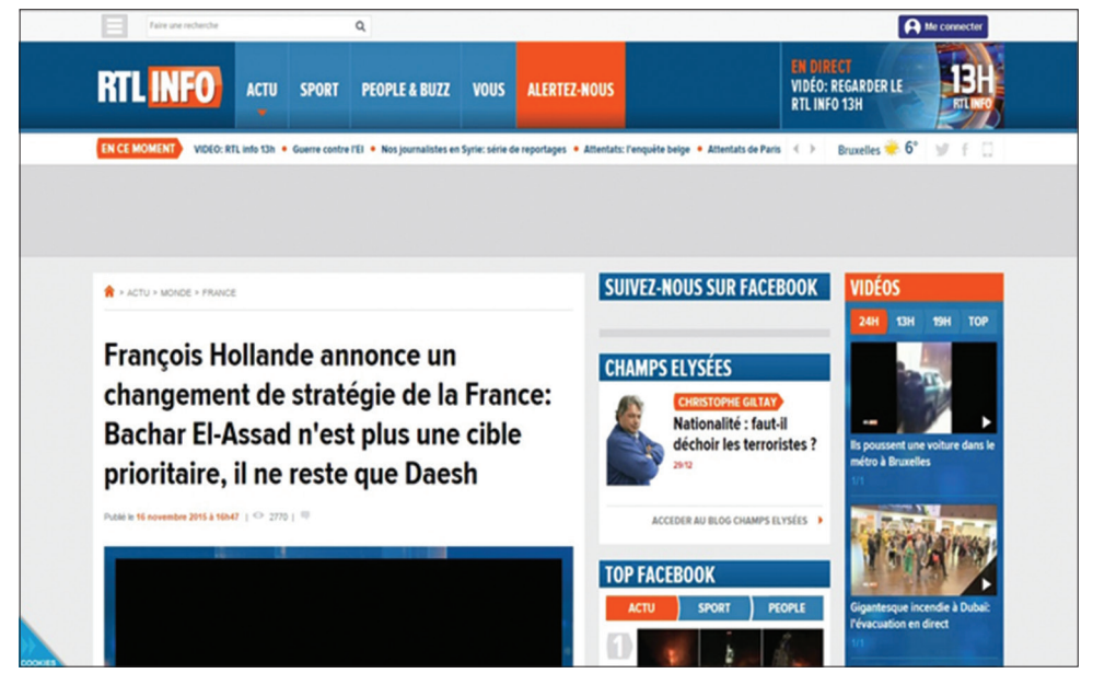
Figure 6. RTL media group

Le Point used the term "Etat islamique en Syrie" in September 2015 and on 16 November 2016, François Hollande used the term "Daesh". This is exactly after the terrorist attacks in Paris. At the same time the Prime Minister, Wallace, used the same term which shows the change in the viewpoint and position of the country to this topic (Figure 6). As we can see here, French government changed its position and after terrorist attacks in his territory they consider Daesh as a terrorist group.