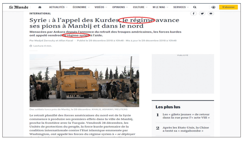
Figure 1. French news paper Le Monde

If we want to mention another example in this regard, we can talk about Western countries and most particularly France's position to ISIL. In Iraq and Syria wars and with the advent of ISIL, from the beginning several Medias used the title of "Islamic State of Iraq and Al-Sham" was used, while the Western countries used the title "Islamic State".