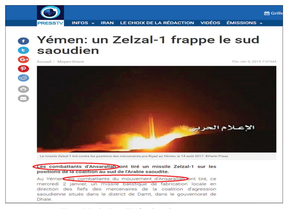
Figure 4. Iranian Press TV, french version

Using this phrase Western media only aimed at attributing the terrorist acts of this group to Islam and Muslims and to introduce Islam as a violent religion that theorizes such behaviors. Using this term was continued in France until the terrorists attacks happened in Paris. Since that time, with the