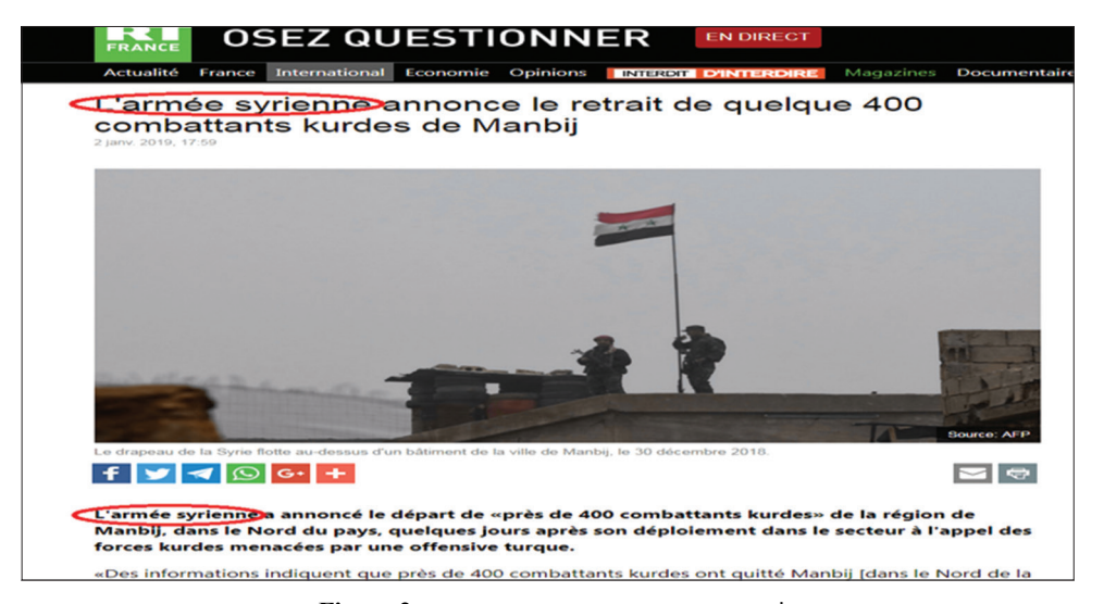
Figure 2. Russia Today agency, french version