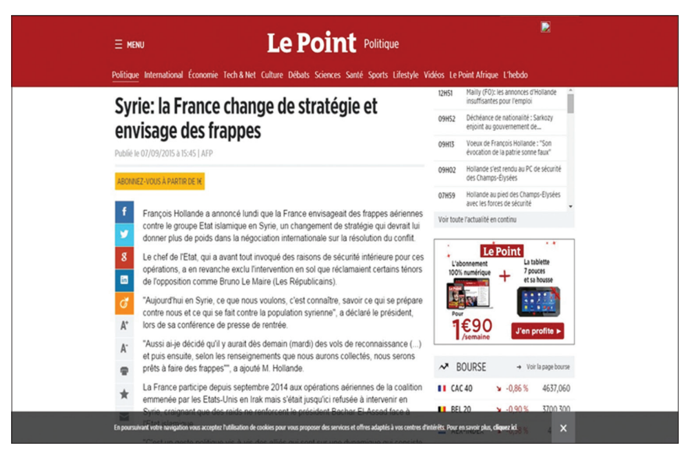
Figure 5. French magazine Le Point