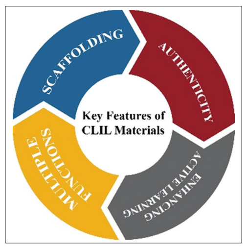
Key features of CLIL materials

using the target language. Sometimes teachers may have to offer hints and suggestions to lead them to gain the content and language. When they get the concept, they will grasp the content and language on their own.