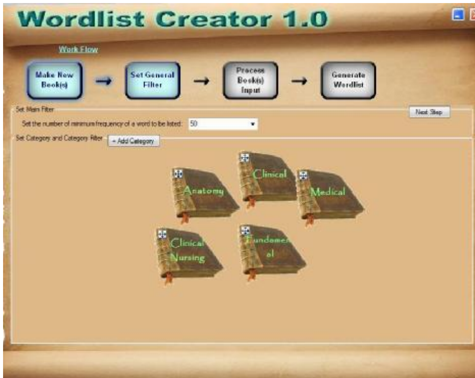
Figure 3: Pre-Filter Settings Process

After the files are loaded, users should click on the ‘next step’ button. Figure 4 illustrates the following steps where the corpus or ‘books’ were formed