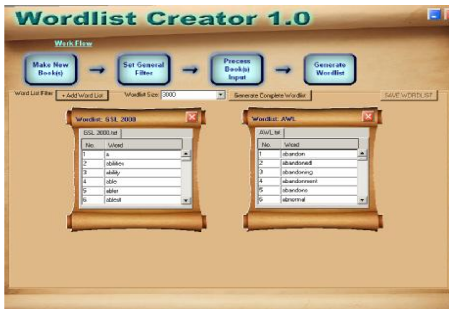
Figure 6: Pre-Word List Generation Step in OWLC 1.0

In the word list generation stage, users will be asked whether the similar words from the GSL and/or AWL of the target words be removed. If users want to activate this function, the ‘add word list’ function must be clicked. Figure 6 shows that the GSL and AWL filters were used and the word list size is limited to 3,000 words only. Users can change the settings of the size of words in the word list created freely.