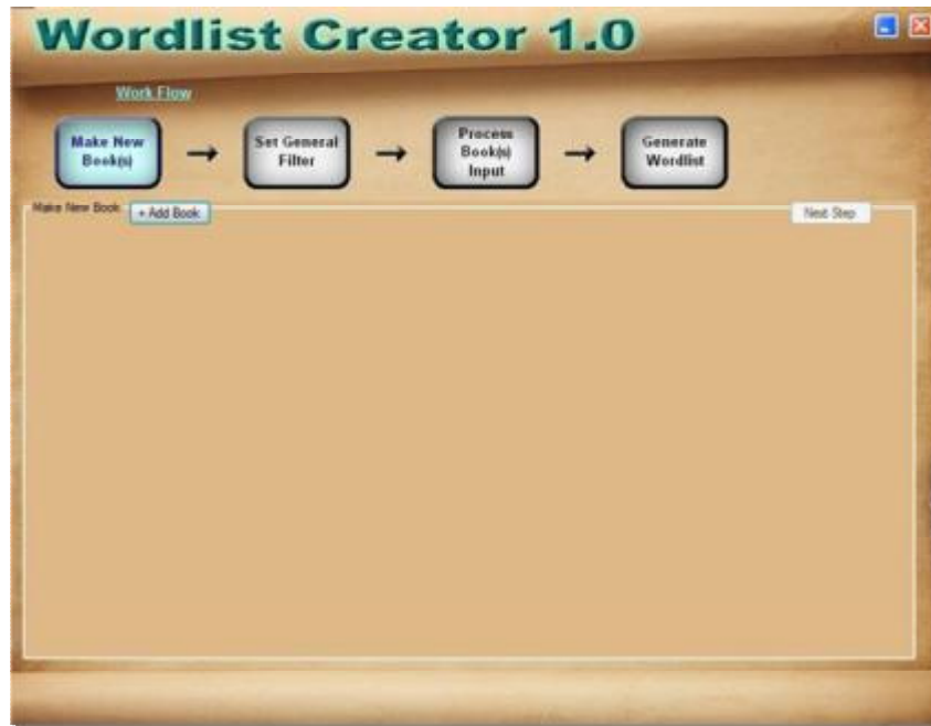
Figure 1: Main Interface of One-Stop Word List Creator 1.0 (OSWLC 1.0)

The best part of this software is that it leads the users step by step in the word list creation process. Users must complete keying in the required data or entry before the next stage can be processed. The indicator in this software will be lighted up should the users are in a particular step. The following illustrations will demonstrate the steps or 'flow' stages involved before a word list can be harvested. Figure 3 shows the addition or loading of files into the programme.