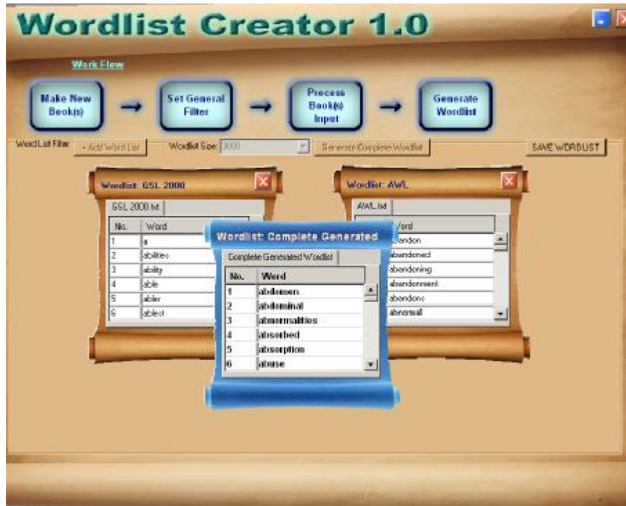
Figure 7: The Word List Generation Process Completed

The moment the button, ‘generate complete wordlist’ is clicked, the final word list, according to the desired criteria set, is developed. From the initial stage to the last stage, users must be aware of the criteria which are desired based on previous corpus linguistics recommendations or development. It is indeed an effortless process, following a string of user-friendly platform, to develop a word list for any fields of study. The word list formed can also be saved into text file format easily. Figure 7 illustrates a sample of the output from the word list generation from this programme. All the diagrams discussed are the elaborated answer to research question 1 ( What would be the main functions of the new model of the word list creation software? ).