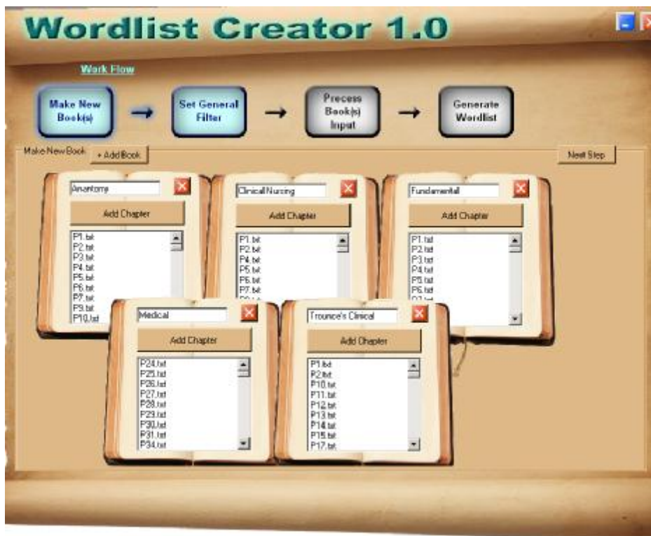
Figure 2: The Loading of Text Files into OWLC 1.0

The best part of this software is that it leads the users step by step in the word list creation process. Users must complete keying in the required data or entry before the next stage can be processed. The indicator in this software will be lighted up should the users are in a particular step. The following illustrations will demonstrate the steps or 'flow' stages involved before a word list can be harvested. Figure 3 shows the addition or loading of files into the programme.