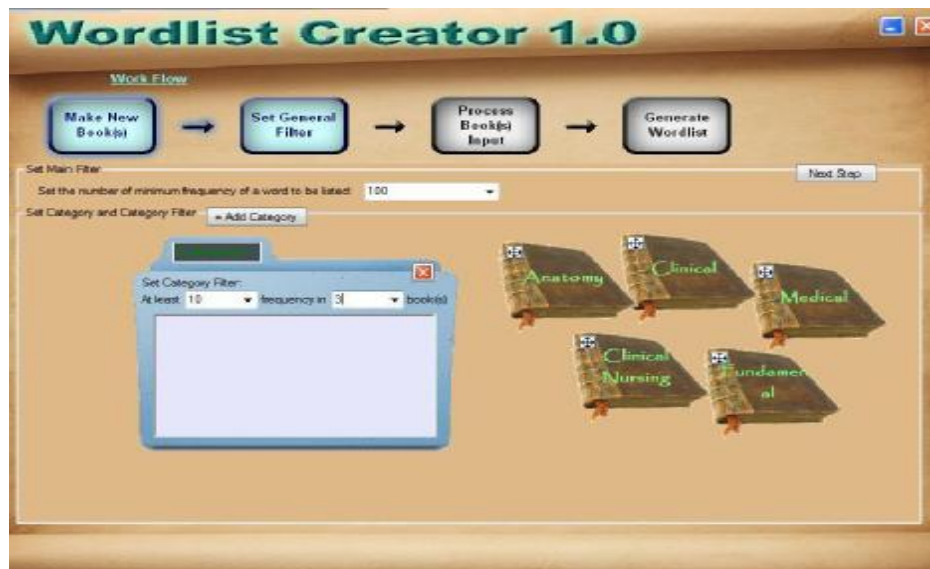
Figure 4: Filter Settings in OSWLC 1.0

Users can now set the required filter frequency of a particular word appearing in the overall corpus and in every individual book. Figure 4 shows one part of the criteria discussed above where a word should appear in any THREE of the technical nursing textbooks with at least 10 words occurrence. In addition, the particular word must appear at least 100 times in the corpus as well. Users can change the settings anytime based on their requirements and the size of the target corpus.