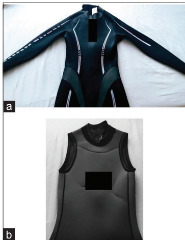
Figure 1. Illustration two main categories of wetsuits used in triathlon: a) Full-sleeve and b) sleeveless.

portion of the wetsuit. An increase in resistance to shoulder movements may influence how active shoulder muscles are. Although it is difficult to relate muscle activity and force during dynamic movements (DeLuca, 1997), there is evidence that muscle activity is related to swim performance. For example, Ikuta et al. (2012) demonstrated that swim velocity was related to muscle activity of several muscles combined. Likewise, Figueiredo et al. (2013) reported that upper extremity muscle activity changed during an intense 200 m swim as swimmers experienced fatigue.