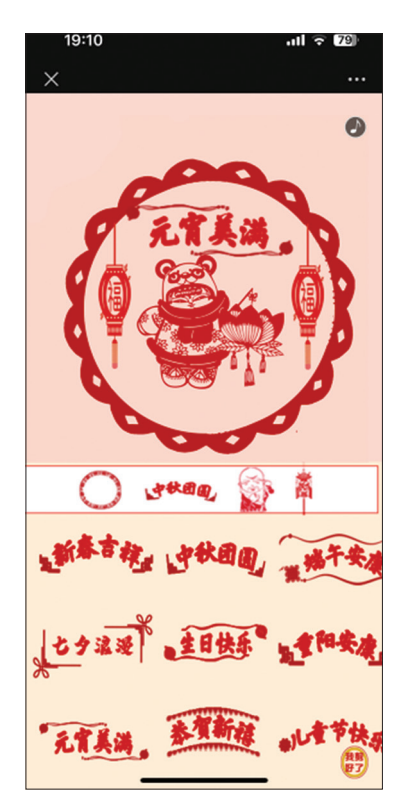
Figure 2. Lantern festival greeting card assembled by users in the game

The lotus lantern tradition of the Lantern Festival is an important cultural custom in the region, originating from the ancient reverence for fire, which further developed with the introduction of Buddhism. Today, Nanjing residents still celebrate with vibrant activities during the Lantern Festival. For example, large lantern fairs are held around the Confucius Temple area, featuring an array of beautifully crafted lanterns that attract numerous visitors. Through such gaming