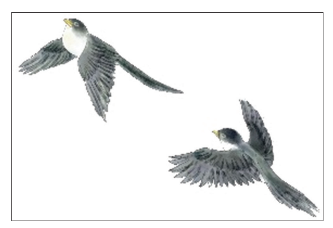
Figure 3. Swallows in paper-cutting games

The interviews focused on several aspects of the swallow paper-cutting symbol's representation in digital games, including its color, shape, composition, visual appeal, symbolic meaning, interactive experience, and cultural educational value. The recorded interview data were analyzed thematically, with information categorized into topics such as color, shape, and composition. Key phrases and statements were extracted to highlight the participants' perspectives on the