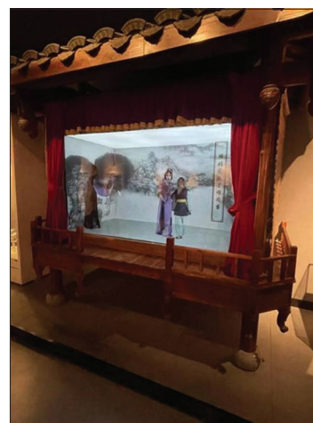
Figure 2. Digital stage of Min Opera Source. Photographed by Xu Lin, 2025