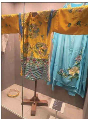
Figure 1. Clothing of Min Opera Source. Photographed by Xu Lin, 2025

New media is a new type of Internet media, also known as the “fifth media.” It includes mobile phones, tablet computers,