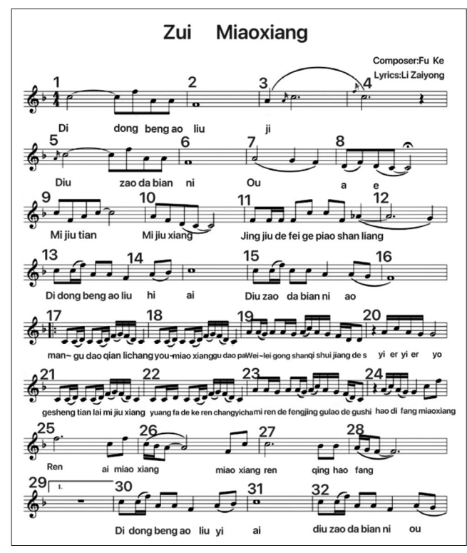
Figure 3. The music score of the Chinese Miao Feige folk song "Zui Miaoxiang"