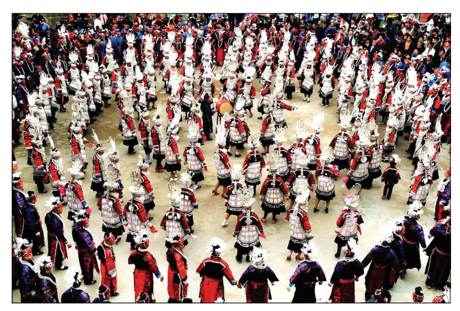
Figure 2. Miao sister festival of Youfang Duige

In summary, the dissemination methods of Chinese Miao Feige songs are diverse and multifaceted, each playing a critical role in their literacy preservation. Understanding these methods provides insights into the current status of Chinese Miao Feige. It highlights how these cultural traditions can be