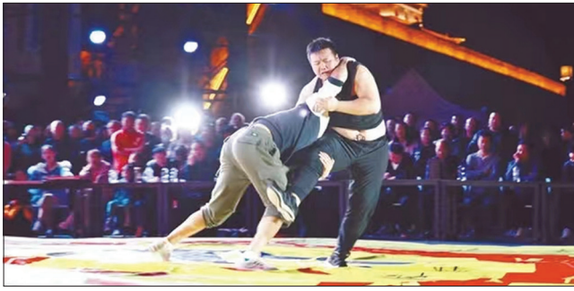
Figure 4. The single cell leg technology in the competition