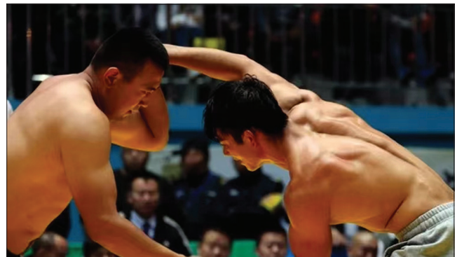
Figure 1. The battle of strength and the confrontation of wisdom

As the sheep wrestling competition has integrated into contemporary society, it has emerged as a symbol of regional and national cultural identity, representing the unique heritage of Xinzhou while resonating with broader audiences. Its inclusion in large-scale cultural and sporting events has broadened its appeal, attracting participants and spectators nationwide. Notably, the 2003 Wrestling Festival, which involved 1,300 athletes and attracted nearly 100,000 spectators, exemplifies the sport's growing influence. In addition to fostering public interest and participation, the competition has contributed to the growth of sports tourism and cultural