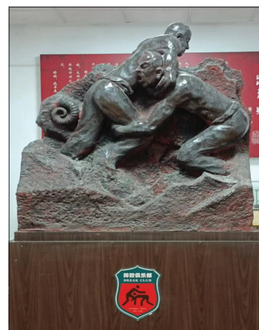
Figure 2. The sculpture in Xinzhou City Wrestling Club