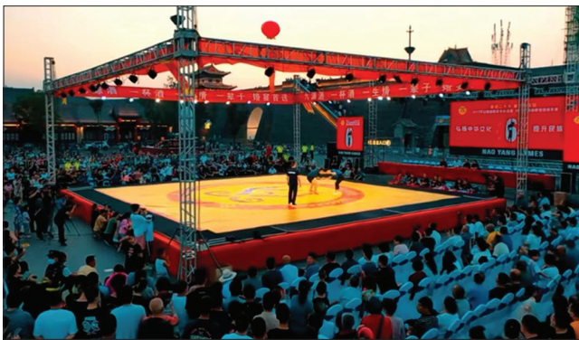
Figure 5. The competition performance stage

more theatrical and immersive quality by incorporating lighting, music, and choreographed movements. These modern enhancements complement the traditional values of sheep wrestling, such as the celebration of strength, skill, and perseverance, ensuring the preservation of its cultural heritage while appealing to contemporary audiences (Figure 5). The competition thus becomes a bridge between the past and the present, honoring longstanding traditions while embracing innovation. Athletes' movements reflect their technical mastery and cultural roots, creating a performance that resonates deeply with local and global audiences (Zhang et al., 2023).