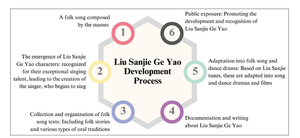
Figure 1. The Liu Sanjie Ge Yao development process

Informal educational settings, such as community workshops and cultural festivals, also significantly promote