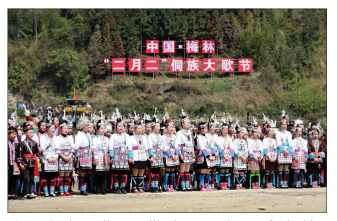
Figure 2. The sanjiang meilin dong grand songs festival in guangxi

The Dong Grand Song, a traditional Chinese singing instrument, faces numerous literacy, inheritance, and protection challenges. Economic development has led to migration