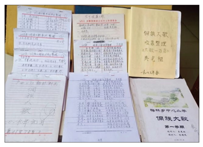
Figure 3. The Dong Grand Song Manuscripts Compiled By Wu Guangzu

Similarly, Wu Chunyue, another prominent song teacher, has been actively involved in the education and dissemination of Dong Grand Songs. Her efforts include conducting workshops and participating in school programs, where she