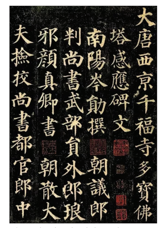
Figure 3. Yan zhenqing's inscription on the many-treasure pagoda

Yan Zhenqing, a renowned calligrapher of the Tang Dynasty, initially studied under Chu Suiliang and later became a disciple of Zhang Xu, from whom he inherited his brushwork. His regular script (Figure 3) developed into a distinctive style known as "Yan Kai," which significantly influenced future generations.