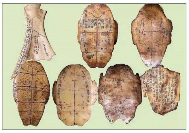
Figure 2. Oracle bone inscriptions of the shang and zhou dynasties

shells or animal bones, inherited from primitive human societies, was continued. These inscriptions mainly consisted of divination records of the late Shang royal court. They formed a complete and mature writing system known as the oracle bone script, the earliest known writing system.