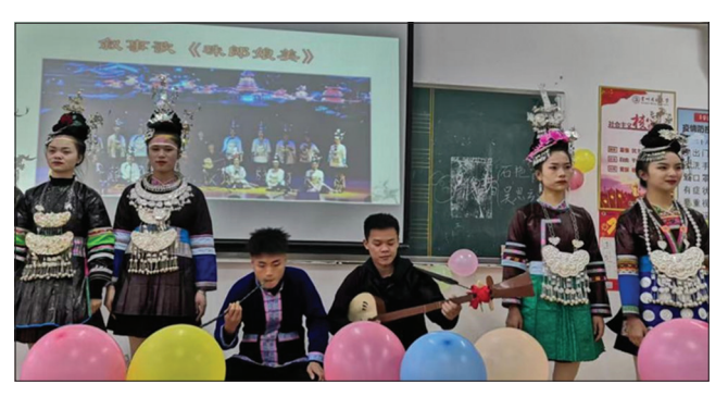
Figure 5. Guizhou Minzu University

as customary events like weddings, initiation ceremonies, and housewarming parties. In contemporary society, changes in social development have expanded livelihood performance spaces to include scenic areas, restaurants, and hotels. Scenic area performance spaces are divided into large-scale stages for the entire area and small performance stages within restaurants and hotels. These venues attract business and tourists, providing additional platforms for Dong Pipa performances. Nonscenic performance spaces, such as urban restaurants and banquet halls, also serve as venues for mobile pipa song performances, often featuring themes like "High Mountains and Flowing Water Toasting."