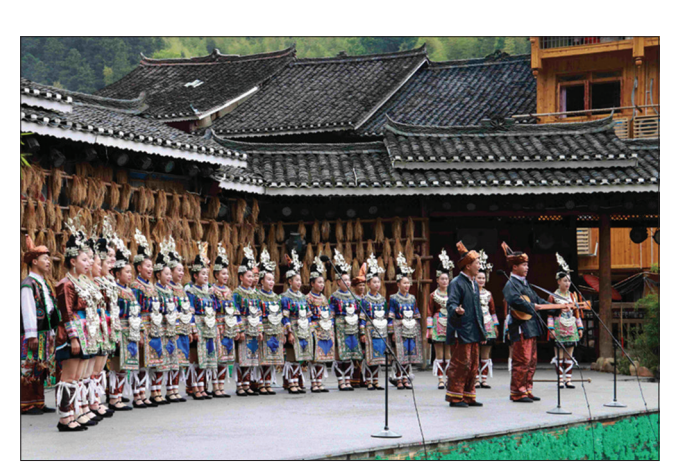
Figure 3. The performance stage in Zhaoxing Dong Village

Stages for Public Performances: Following the development trajectory of traditional Chinese performing arts, fixed performance stages for Dong Pipa emerged, particularly in professional theaters. These stages offer elevated platforms for optimal viewing angles, enhancing audience engagement and focus. Initially, Dong Pipa songs were performed in village life spaces without dedicated stages. However, with organized performances by the government and other entities, these songs are now performed on both indoor and outdoor stages, such as the performance area in the Zhaoxing Scenic Area. Temporary stages are set up in diverse locations like conference podiums, community squares, shopping malls, and basketball courts, allowing for flexibility in performance venues. These stages facilitate artistic, cultural, and entertainment activities, making Dong Pipa accessible to wider audiences and enhancing its educational and cultural literacy, as shown in Figure 3.