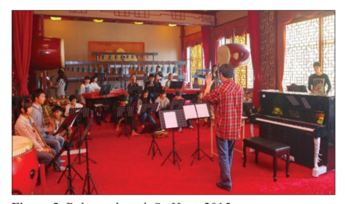
Figure 3. Rehearsal work Su Hang 2015

In the realm of musical practice, etudes play a pivotal role as pieces of music crafted to refine performance techniques. These compositions typically focus on specific technical aspects, aiming to enhance particular areas of musicianship. At the School of Music, the teacher devised a series of Bian Zhonge etudes inspired by the distinctive traits of Xu Gongning Bianzhong. This innovative approach significantly contributed to the improvement of students' learning outcomes and mastery of Bian Zhonge's performance techniques, as shown in Figure 4.