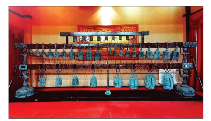
Figure 2. Xu Gongning bianzhogn used by the School of Music, Pingdingshan University

The transmission of Xu Gongning Bianzhong in classroom teaching at Chinese universities is a comprehensive process embedded within a structured teaching system. This system encompasses various elements such as knowledge structure, teaching content, methods, process, and evaluation. One crucial aspect of this system is the course credit setting, exemplified by the "Grace Training" professional elective course offered by the School of Music, which adopts a "modular" curriculum system. This course belongs to the regional music culture module and includes band training, dance team training, and singing team training, with Bian Zhonge courses integrated into the band training component. By teaching traditional Chinese ritual music culture