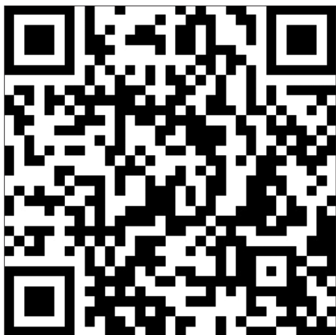
Figure 2. "Animism" 3D animation QR code

Now we turn to the discussion of the opportunities and challenges for the inheritance and protection of Manchu paper-cutting in Yiwulv Mountain. We studied the dilemma of inheritance and protection of Manchu paper-cutting in Wulu Mountain. After reviewing the literature, it is found that the inheritance method of Manchu paper-cutting in Wulu Mountain has been passed down from generation to generation, and its main inheritance method has changed, that is, from relying mainly on family inheritance to master-disciple. The change in the inheritance method also expresses the trend of a sharp decrease in the number of representative inheritors of the family, indicating that there are fewer people in the family who are willing to inherit the Manchu paper-cutting of Wulu Mountain, and there is a risk of no one to inherit it. It is necessary to increase the number of inheritors by facing the society. Through the analysis of the number of people, scope, and inheritance methods of Manchu paper-cutting inheritance in Yiwulv Mountain, it was found