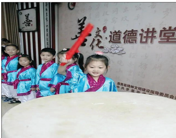
Figure 2. Children should play drums before going to school

in the Book of Rites University, it emphasizes that the path to enlightenment lies in cultivating virtue. However, being intangible, morality requires more than mere written language to propagate; it necessitates tangible mediums for implementation and demonstration. In this regard, rites and music serve as carriers and conduits for moral education. They embody and reflect moral principles through the fiery essence that connects heaven and earth. The impact of good music resonates deeply within individuals, fostering qualities such as ease, integrity, love, courtesy, dignity, and respect in their behavior, speech, and actions, thereby earning them admiration and esteem, as shown in Figure 3.