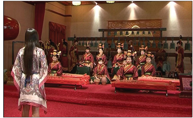
Figure 5. Students study musical instruments, playing

It is imperative to establish educational programs and institutions focused on teaching and training musicians in the intricacies of ancient court music. This includes delving into traditional musical notation and grasping the cultural context and symbolic meanings embedded in court music. Additionally, promoting the development and reconstruction of Chinese court music culture alongside university campus culture is vital. For instance, the Pingdingshan University court band team engages in activities such as mining, sorting,