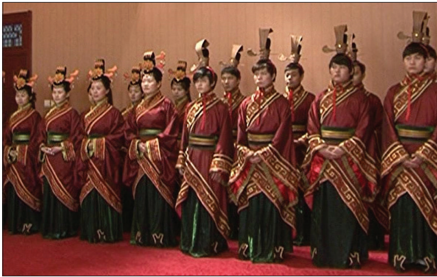
Figure 4. College students learn standing posture etiquette in court music