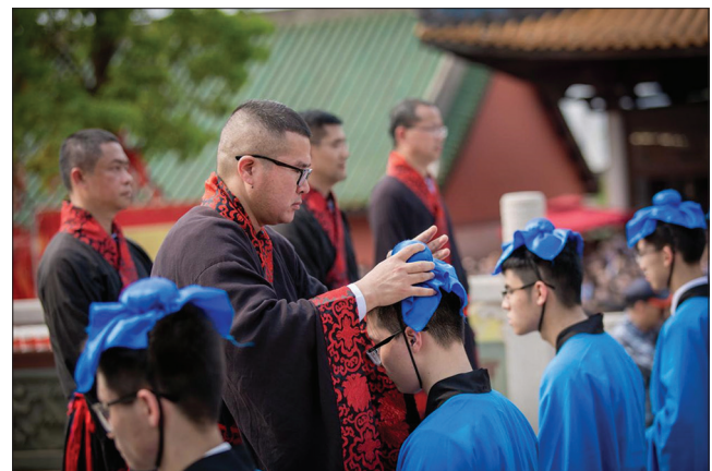
Figure 3. Men’s adult etiquette

Secondly, emphasizing harmony and order imparts wisdom in the “globalization” theory realm. The historical progression from the Rites of Zhou to the Han Dynasty’s Rites