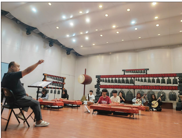
Figure 7. Students are at the classroom on-site from the Court Music Orchestra