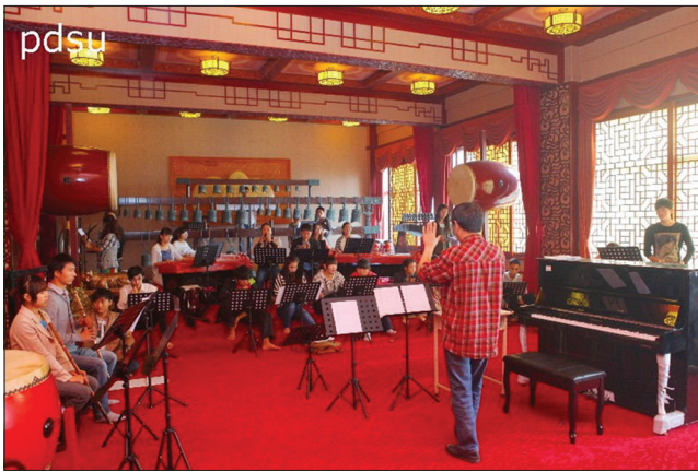
Figure 6. Students are at the classroom on-site from the Court Music Orchestra