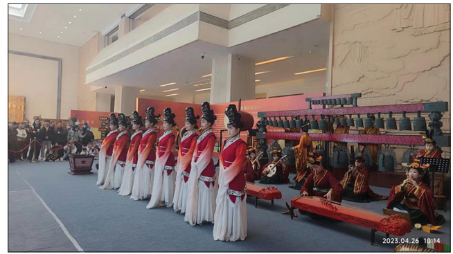
Figure 9. The premiere of "Xu Guo Chime Go Home" performed

music from the Zhou Dynasty among students and the broader community.