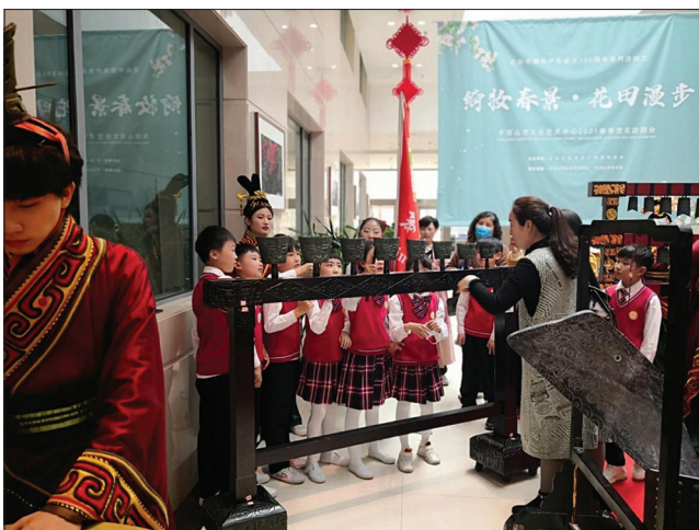
Figure 8. Showcasing court instruments to citizens and primary school students