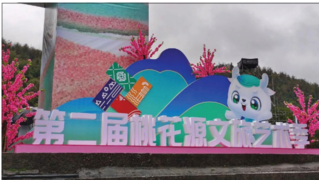
Figure 3. The Opening Ceremony of the Youyang Rural Art Season

Most importantly, this approach regards residents as active participants in the artistic process.