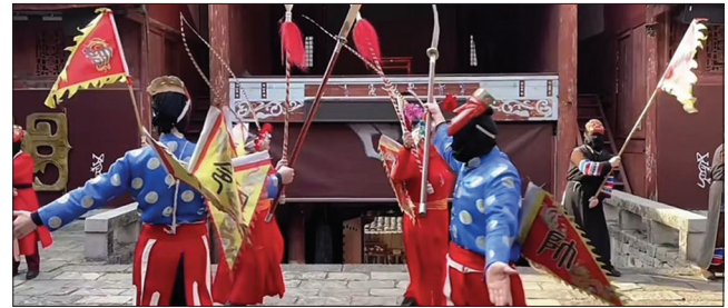
Figure 4. Tima Ancient Song Performed in Gongtan Ancient Town

Nestled in the heart of the Wuling Mountains in Chongqing, Youyang spans an area of 5,173 square kilometers and serves as a vibrant hub for the Tujia and Miao ethnic groups in southeast Chongqing. The region is rich in ethnic cultural resources, housing four national-level intangible cultural heritages and over 200 municipal and county-level intangible cultural heritages. Youyang has earned titles such as