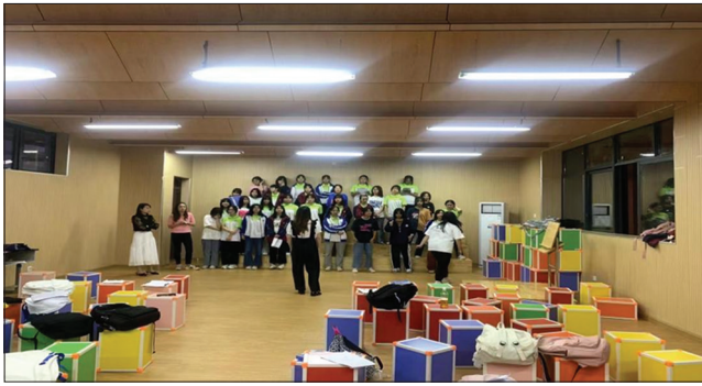
Figure 2. Students' chorus of Youyang folk songs