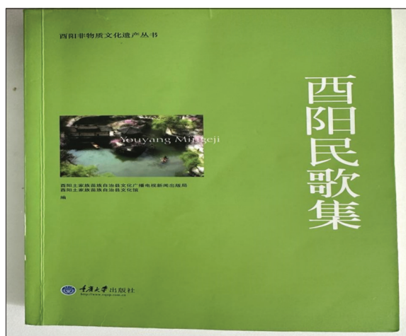
Figure 5. Selected Youyang folk songs

In conclusion, the preservation and transmission of Youyang folk songs require collaborative efforts from multiple stakeholders. Educational institutions play a crucial role in integrating folk songs into curricula, while artistic engagement in rural communities revitalizes vernacular culture. Government initiatives provide policy support and funding for preservation efforts, while publication efforts ensure the availability of resources for inheritance and protection. By leveraging these strategies, Youyang folk songs continue to thrive as an integral part of China's cultural heritage, inspiring pride and identity among its people.