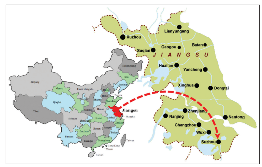
Figure 1. Map of research site in Suzhou, Jiangsu Province, China