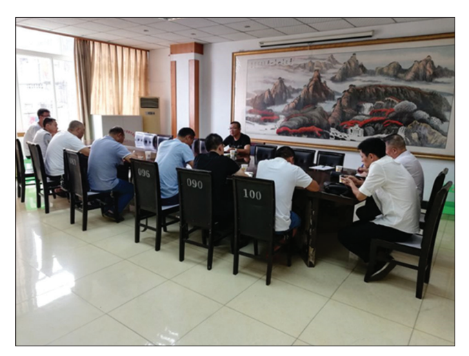
Figure 4. The Staff members of the Naxi District Cultural Center have convened a meeting

Source: Wenxing Wang, from fieldwork and drawn the map in March 2023