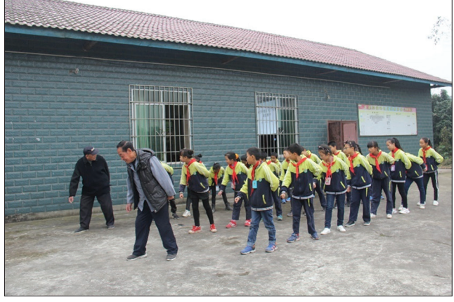
Figure 3. Yongning River Boatman Work Songs Promotion Academy

This topic discusses the importance of collaborative efforts involving local individuals, cultural centers, educational institutions, and government authorities in preserving and promoting these songs. The preservation and promotion of Yongning River Boatman Work Songs are not solitary endeavors but the result of collaborative initiatives that have brought together various stakeholders within the community. This section sheds light on the significance of community collaboration in conserving and propagating these cultural gems, as shown in Table 4.