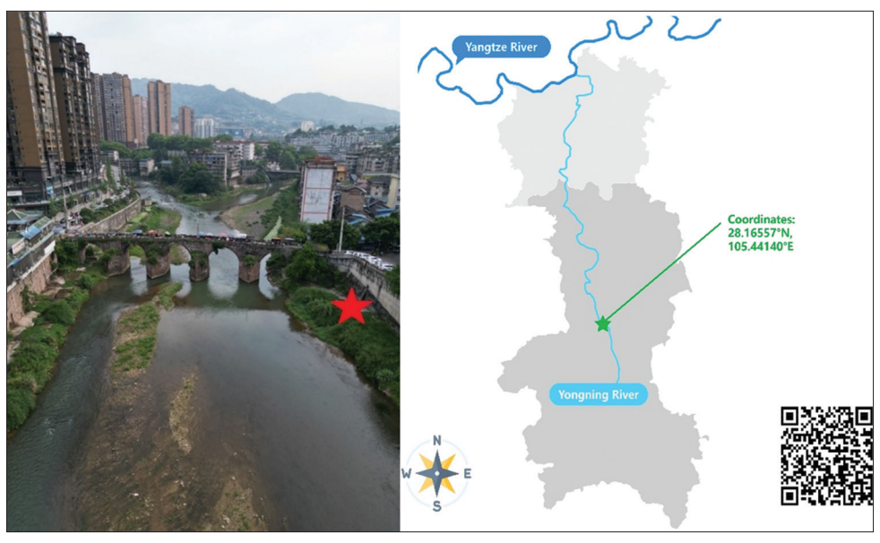
Figure 2. Yongning River, Xu Yong Dock

tools. These songs have deepened the connection to cultural heritage and become a testament to the enduring legacy of this rich tradition. Through education, these songs are not merely preserved; they are cherished, understood, and celebrated by new generations, as shown in Figure 3.