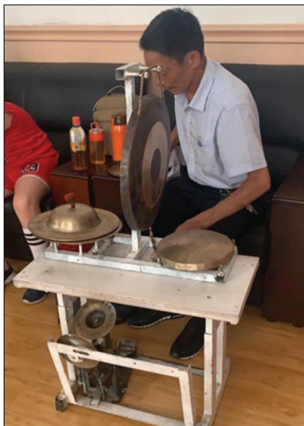
Figure 3. Xinyang Folk Musician