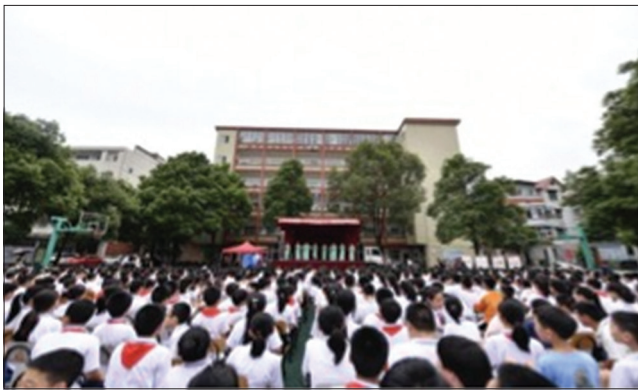
Figure 2. Changde Sixian Enters Primary School

providing an exceptional environment for its continued development, as shown in Figure 3.