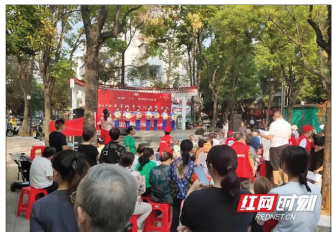
Figure 5. Changde Sixian Enters the Community