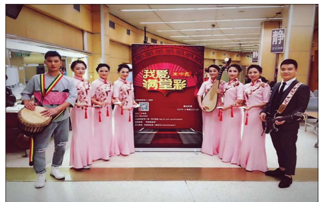
Figure 4. Changde Sixian on TV