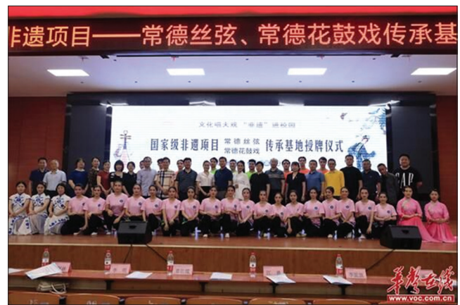
Figure 3. Changde Sixian Enters Colleges and Universities

This approach seamlessly integrates Changde Sixian into the lives of residents, forming a vital aspect of the community's cultural fabric. It ensures that Changde Sixian remains relevant in contemporary society, contributing to its continued cultural development.