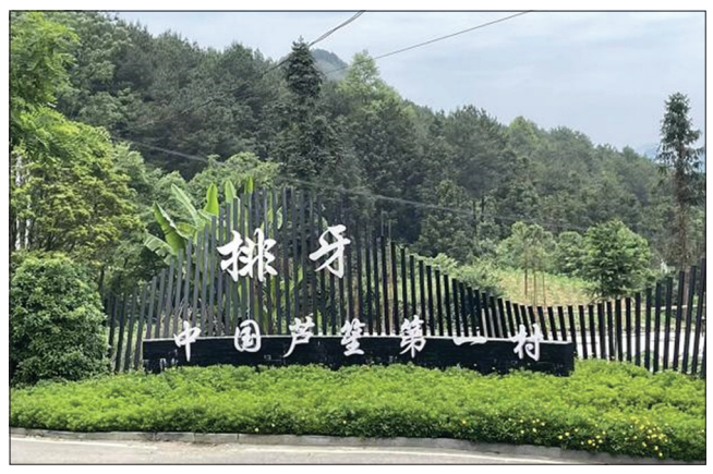
Figure 3. The construction of a Lusheng in Paiya village, Qiandongnan, Guizhou Province

These strategic policies and community-driven initiatives, exemplified by the enterprising spirit of villages like Langde Miao, underscore the government's unwavering commitment to nurturing and preserving the cultural legacy of Lusheng. These initiatives not only bolster economic growth but also celebrate the profound cultural heritage embodied by the soulful melodies of Lusheng, ensuring that this cherished tradition continues to thrive and resonate across generations.