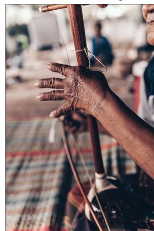
Figure 1. Saw isan hand and arm positioning