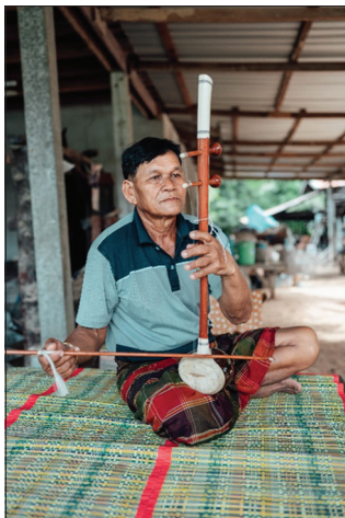
Figure 3. Saw isan sitting posture