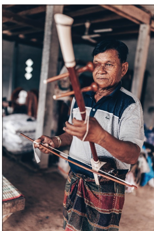
Figure 4. Saw isan standing performance stance

Moreover, the precise application of the optimal level of pressure is of paramount significance. The application of inappropriate pressure may result in the production of distorted sound. This approach demonstrates optimal efficacy when executed, hence facilitating the seamless resonance of the strings. The utilization of string conversion techniques is frequently applied within this particular genre of music, serving to significantly augment the overall quality of performance. This, in turn, contributes to the preservation and transmission of the Saw Isan heritage.