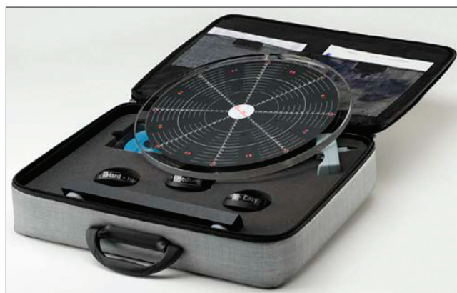
Figure 1. Techno body prokin balance measurement device

The participants were informed about the measurement tools and important points about the measurement process was explained before they were involved with test measurements. With the purpose of introducing the devices and showing how the measurements were going to be done, the participants were asked to try out after example trial measurements were taken by the researchers. The participants were asked to do two trial measurements and the best score were recorded to the measurement forms to be used in the evaluation. In order to measure dynamic balance, the “Techno Body ProKin Balance Measurement Device” was used (Figure 1).