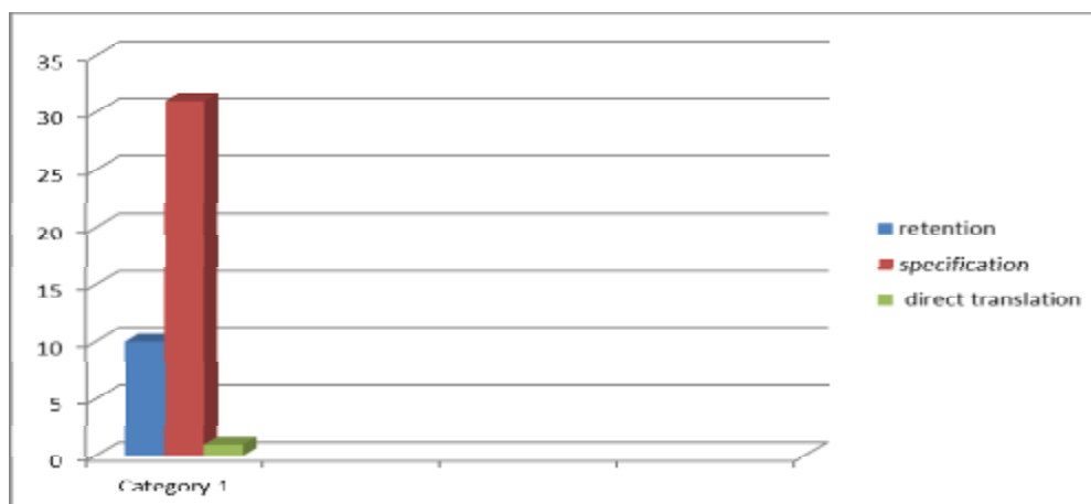
Figure 2. The frequency of source-oriented strategies