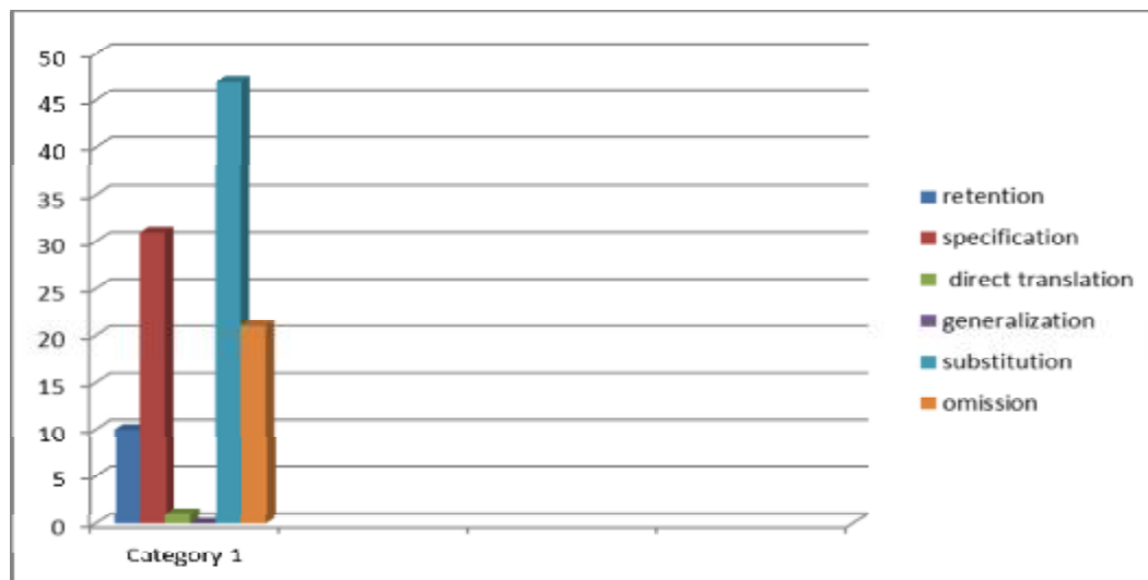
Figure 4. The frequency of all of the strategies used in the Persian translation of the novel Spartacus