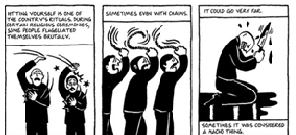
Panel 2: Persepolis: The story of childhood.

Satrapi presents negative images of Islam; she portrays Islamic rituals and scoffs them. Her depiction leads Western readers to the idea that Islam is a religion of violence and barbarism. To show this, Satrapi asserts that "hitting yourself is one of the country's rituals, during certain religious ceremonies, some people flagellated themselves brutally. Sometimes even with chains. It could go very far. Sometimes it was considered a macho thing" (2003: 96). In one panel, she depicts a man stabbing his head with a dagger: