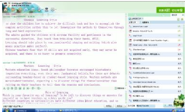
Figure 2. Materials Uploaded for a Discussion on Cultural Diversity

Pop Vane to improve multicultural awareness: to arouse the students' passion for English learning and multicultural awareness, a learning assistant in charge of introducing foreign pop music and movie hits uploads excellent videos or PPT of foreign songs and movies on a weekly basis. He is a student with huge zest for English and foreign cultures, actively shouldering the task of helping group members to improve interests in English through keeping abreast of Western entertainment trends. He has shared with other group members 11 beautiful songs and 11 delicate PPT to match with video image, such as Boyzone, Angel, and Mariah Carey. The pop culture is the vane and pace of a culture, to appreciate the music and movies from other cultural backgrounds is an efficient strategy and a shortcut to increase multicultural awareness among foreign language learners.