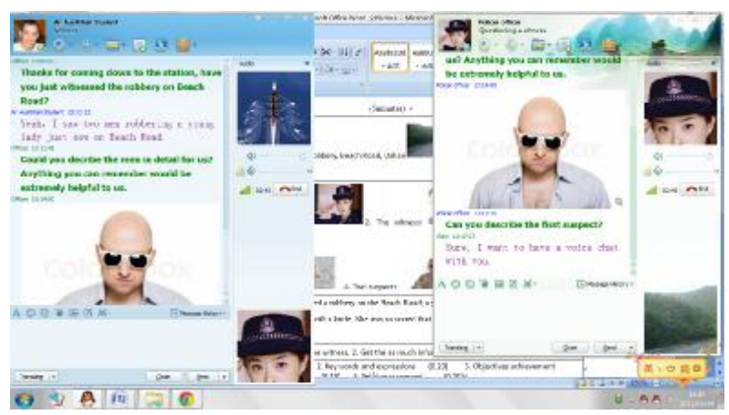
Figure 3. The "Police Officer" Is Questioning the "Witness" through Typing and Voice Chat via QQi

A trainee above QQ level 16 (those with level less than 16 are not allowed to choose an icon from the local pictures) can sign in the VPIE group with the registered QQ number and the password, change the icon, nickname with the icons and characters in Table 2. Figure 3 shows a trainee acting the police officer first typed, then had a voice chat with another member acting the witness: