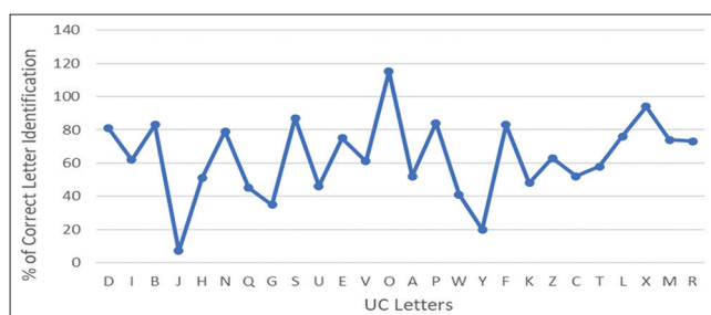
Figure 1. Frequency of UC letters correctly identified by third graders in the test

According to Figure 2, the LC letters most often correctly identified by third graders were o (98.3%), x (82.1%), e (74.4%), n (72.6%), r (70.1%) and m (68.4%). The six least