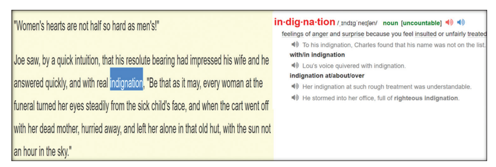
Figure 3. The Longman electronic dictionary with the text