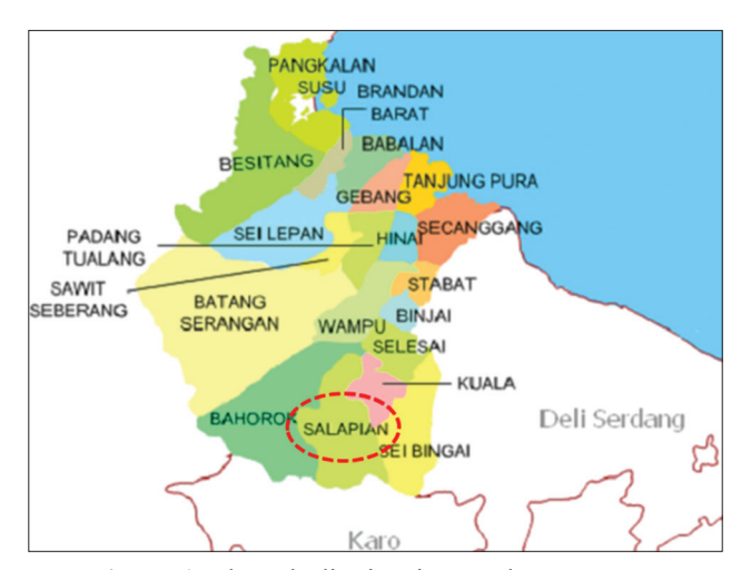
Figure 1. The sub-districts in Langkat Regency

this context refers to an effort to make the cengkah-cengkah game gain its popularity back. According to Wilczkiewicz and Wilkosz-Mamcarczyk (2015, p. 72), revitalization can be defined as a many-sided effort including revalorization, restoration, reconstruction, modernization, and actions aimed at revival of a building, district or a town devastated in various aspects, also economic and social aspects. This idea suggests that revitalization can be used in various meaning depending on the discipline (architecture, social sciences, economics, laws, etc.). In relation to Wilczkiewicz and Wilkosz-Mamcarczyk's definition, the revitalization in this paper is related to efforts of maintaining Karonese ecolexicon through cengkah-cengkah game. In addition, doing this research also shows one the 10 efforts of language maintenance proposed by Kirkness (2001) that includes: (1) banking our languages, (2) raising the consciousness level of our people, (3) mobilizing our resources, (4) providing training and certification, (5) developing a comprehensive and appropriate curriculum, (6) engaging in meaningful research, (7) informing public opinion, (8) eliminating artificial boundaries, (9) pressing for local language legislation, and (10) working together. Therefore, the larger the number of studies on a certain language is conducted the more likely that language will be maintained.