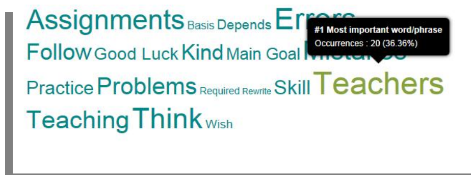
Figure 2. Text analysis and thematic representation of word frequencies in question 15 using NVivo® software.

There were 81 comments in total, which mainly focussed on two main areas: teachers and errors. This was obtained using the text-analysis software, NVivo® where initially, the data was queried into word frequency distributions and tag clouds. The analysis gave a thematic word frequency as well as a percentage of occurrences in the participants' comments (Figure 2).