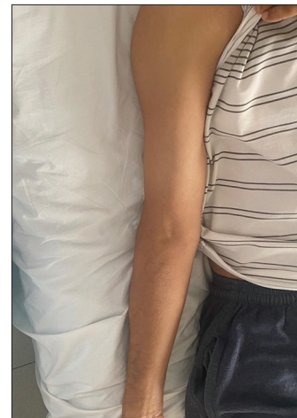
Figure 4. Clinical image of the upper right limb increased in size