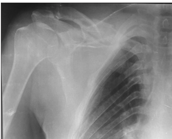
Figure 2. Right shoulder x-ray showing a comminuted fracture of the middle third of the right clavicle