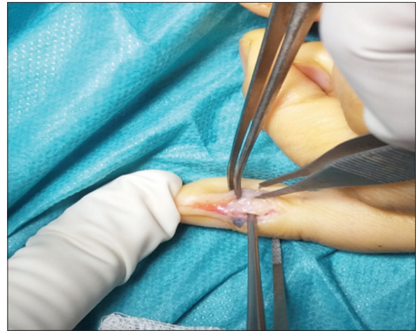
Figure 4. Intraoperative view of the tumor by inguile latero approach

Masson's glomus tumor [1] is a benign tumor formed at the expense of neuromyo-arterial tissue, located at the level of capillary-venous anastomoses of regulation, particularly numerous, at the level of the digital extremities. These tumors are rare, but not exceptional [4], their frequency varies from 1.6 to 5% of all tumors of the soft parts of the hand [5,6]. It mainly affects young adults of the female sex, and sits with predilection at the ends of the fingers and particularly under the nail.