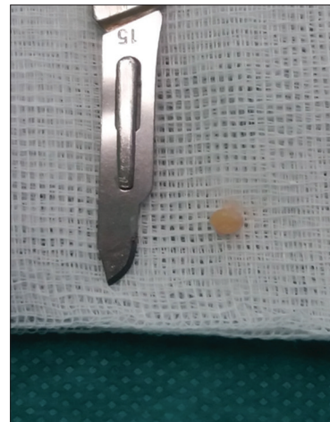
Figure 5. Appearance of the tumor after excision

The diagnosis is evoked before a small painful nodule of the extremities associated with a characteristic triad: cold hypersensitivity of the affected area, paroxysmal pain and exquisite pain on touch. The diagnosis of certainty is based on a bundle of arguments because only histology is formal. The clinic, when it is typical, can alone be sufficient for the diagnosis. However, the surgeon requests evidence of the existence of a tumor of the finger, and wishes to know precisely its location which determines the surgical approach, medial trans-nail or lateral.