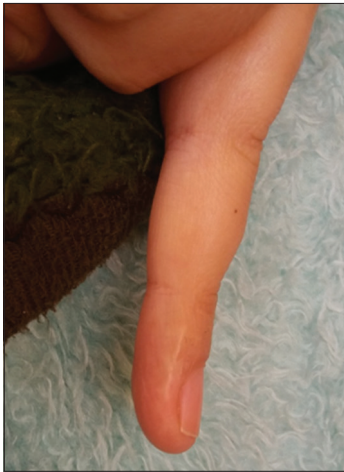
Figure 1. Recurrence of a glomus tumor