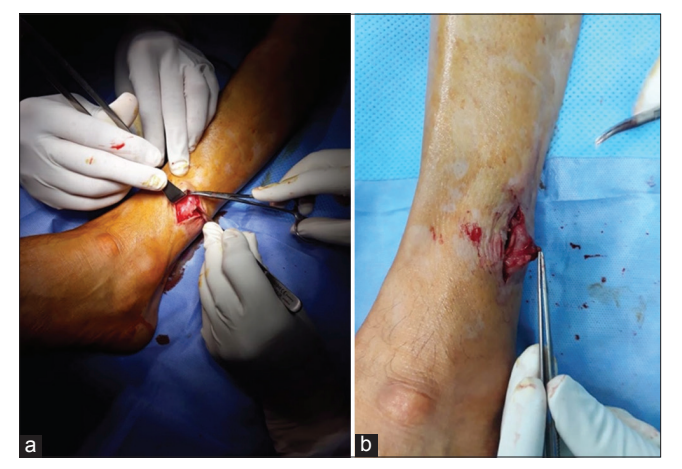
Figure 2. The intraoperative aspect of the tumor (a,b)