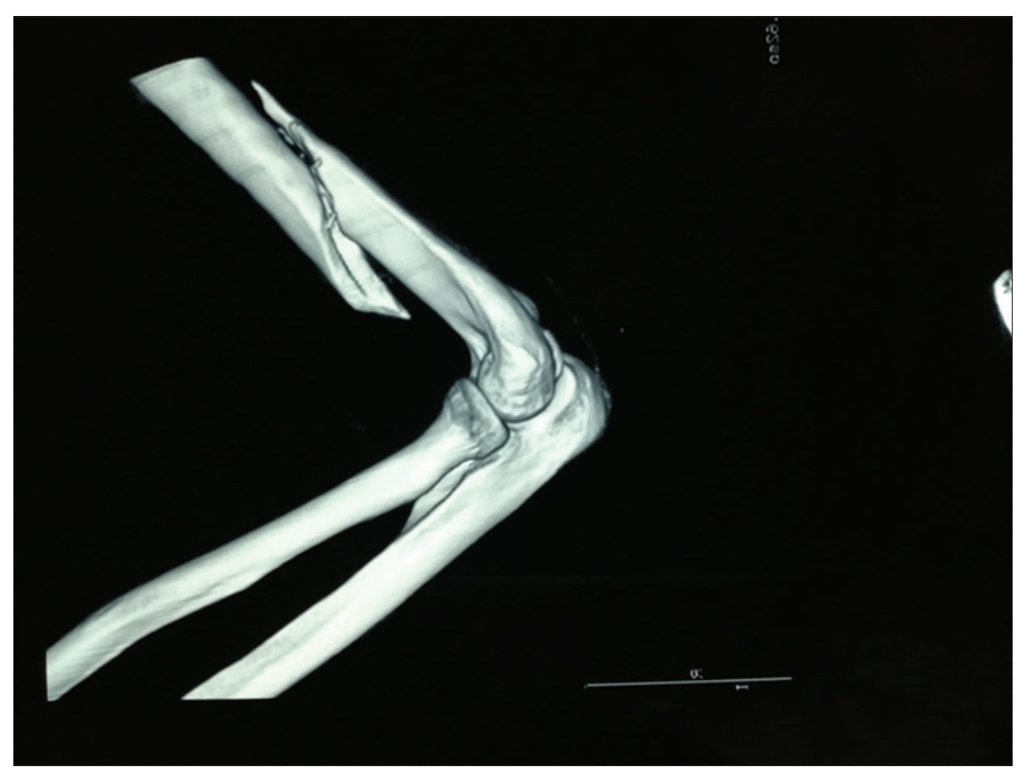
Figure 2. A 3D computed tomography scan of the right arm revealed a simple spiral fracture with neither underlying pathologic process of the bone nor fracture of the ipsilateral elbow