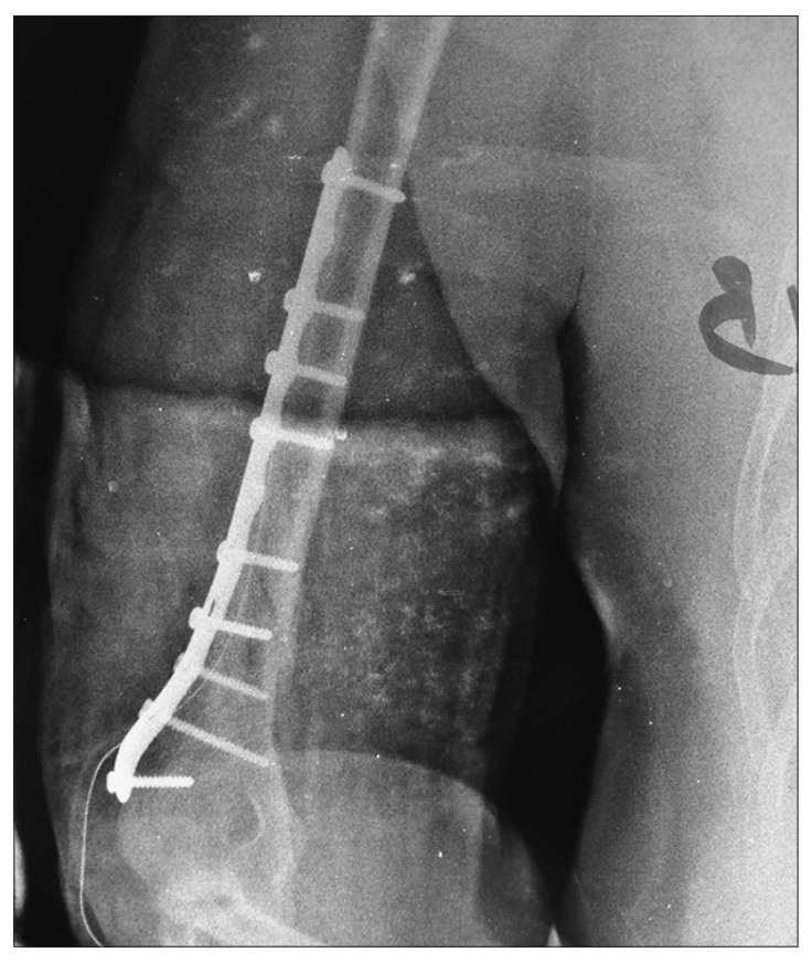
Figure 3. The postoperative radiograph of the arm confirmed the good position and reduction of the fracture

that day, he reported that he had experienced no prodromal arm pain. The neurovascular exam found radial nerve palsy: active finger or wrist extension was slightly possible along with anesthesia over the first web space dorsally. X-ray of both shoulder and arm revealed a spiral fracture of the distal third of the humeral shaft (Figure 1).