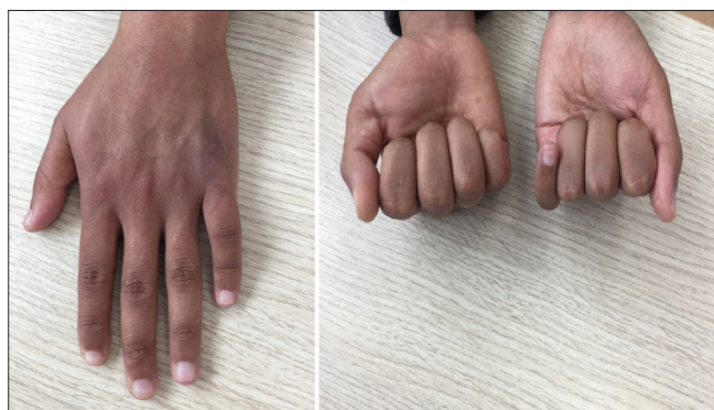
Figure 3. Clinical aspect at a follow up of 12 months