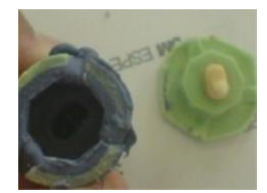
Figure 1: Impression taking from prepared tooth with custom tray and polyether impression material

One sound extracted maxillary first premolar was cleaned and embedded in autopolymerizing resin block (Acropars 200, Tehran, Iran). The resin was extended within 3 mm of labial cemento-enamel junction. The tooth was prepared with a circular 1.5 mm wide palatal chamfer, buccal shoulder finish line with a bevel and an occlusal reduction of 2mm. All sharp angles were smoothed and the edge of margin was placed 0.5 mm apical to the cement-enamel junction. A custom impression tray with a 2 mm relief was made from autopolymerizing acrylic resin and impression of the prepared tooth was made with polyether (Impregum, 3M ESPE, USA) impression material (Fig 1). The impression was poured with an autopolymerizing resin (Duralay, GC America Inc, USA) as a pattern for fabrication of a metal die. Then, the master die was cast with a base metal alloy (Sankin Nonberyllium, Denstply, Japan).