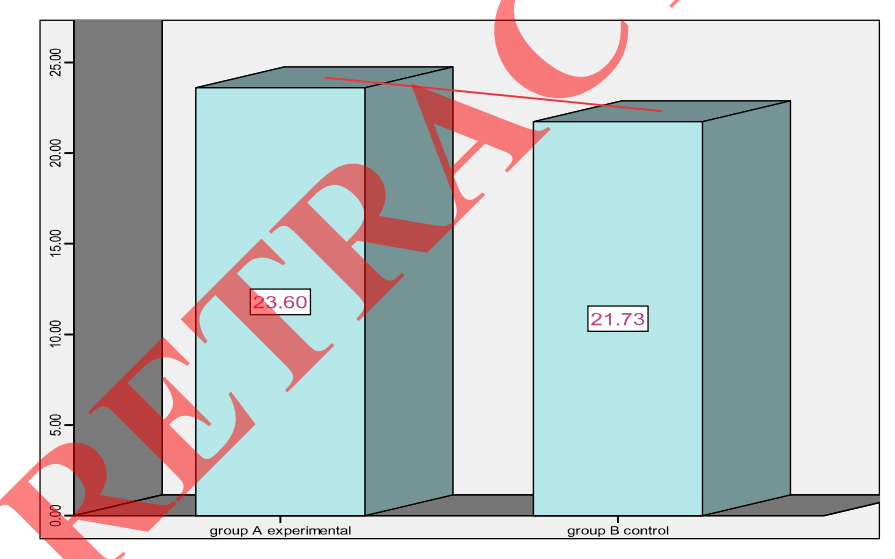
Figure 3. The mean scores of the control and experimental groups at TOEFL post-test

The data in table 3 indicates that there is a significant difference between the mean scores of the control and the experimental groups at the .05 level at TOEFL test. This analysis shows that the subjects in the experimental group again achieved higher scores than those in the control group. The findings further reject the second null hypothesis as there is no significant difference between the experimental group who received instruction on test taking strategies and the control group who did not receive specific training on test taking strategies in terms of their performance on TOEFL test.