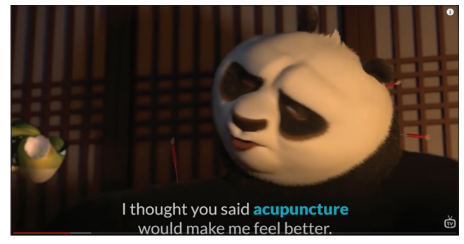
Figure 2. Part of the Movie Clip - https://www.youtube. com/watch?v=SAY6Mptrj5s

The researcher used a traditional method to teach the other set of vocabulary for the same group of students. A text-book (English Unlimited by Cambridge) was used in the