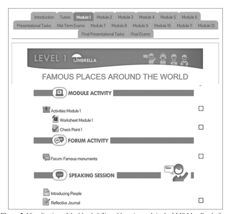
Figure 2. Visualization of the blended-flipped learning path in the LMS Moodle platform